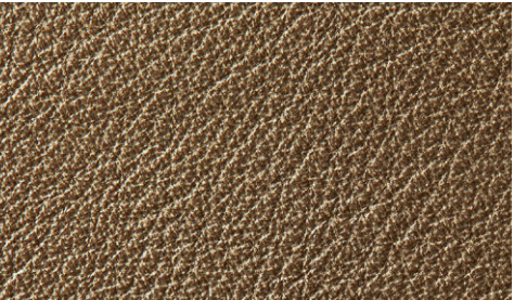
*755 Gold Leaf