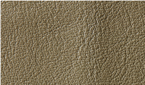
* 764 Limestone