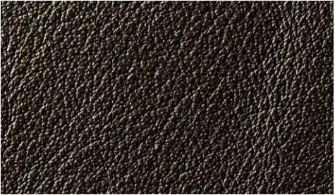
* 761 Pewter