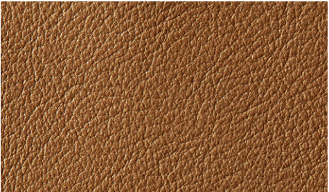
* 756 Bullion

Colour variations can be expected to occur within each hide, from hide to hide and from batch to batch.