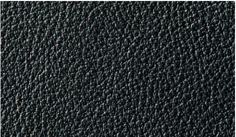
* 765 Graphite