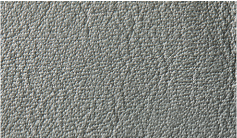
* 762 Sterling