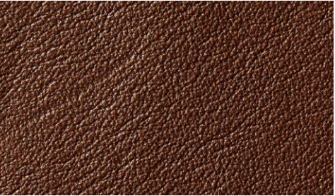
* 759 Copper