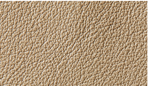
* 752 Rustic Pearl